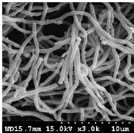
Fig. 2 Scanning electron micrograph of Streptomyces sp. KORDI-3238 grown on modified Bennett's agar at 27°C for 3 days. The bar represents 10 \mu\text{m} .

analysis showed the presence of LL-DAP in the peptidoglycan [20]. Glucose and ribose were detected in the whole-cell hydrolysates. Liquefaction of gelatin and hydrolysis of starch were positive at 7 days. Production of \text{H}_2\text{S} and reduction of nitrate (weak reaction after 14 days) were observed. This strain utilized D-Glucose, D-Xylose, L-Ramnose, D-mannitol, D-Sucrose, and D-Galactose as sole carbon sources, but not D-fructose and L-Arabinose.